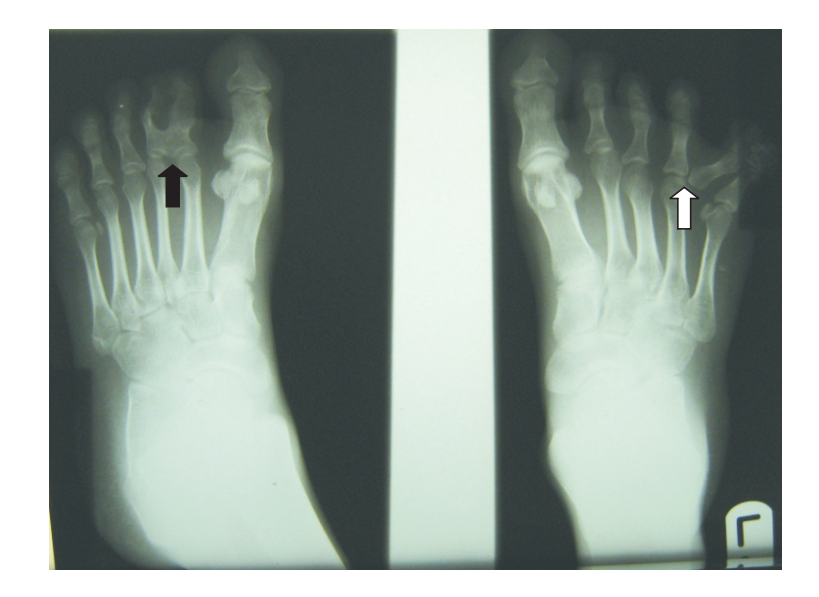
Figure 4: Plain radiographs of the feet demonstrating six digits in the right foot with fusion of the 2<sup>nd</sup> and 3<sup>rd</sup> proximal phalanges at their bases (black arrow). The left foot shows five rows of metatarsals with the 4<sup>th</sup> metatarsal having two proximal phalanges (white arrow).