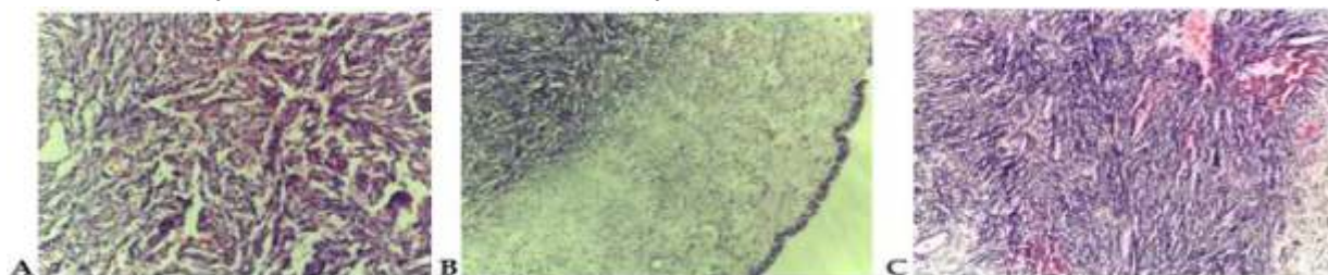
A, section shows tissue partly covered by respiratory type epithelium (white arrow) and malignant mesenchymal neoplasm composed of plump spindle shape cells (black arrow), (H and E X100).