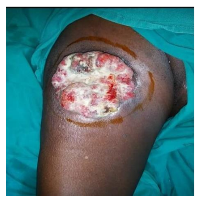
Figure 1: Photograph of the skin lesion on the anterior aspect of the proximal right thigh before excision and skin grafting

The prostate adenocarcinoma with skin metastasis was confirmed after diagnostic biopsy, and treatment options were explained and discussed with the patient. He rejected bilateral orchidectomy. However, for the skin lesion, we performed a wide local excision and split-thickness skin grafting. He was commenced on androgen deprivation therapy (ADT) before his discharge. The skin graft healed very well roughly a month after the surgery (Figure 4). Three months later, he presented with features of distance metastasis to the lungs and liver. He died six months from the commencement of treatment.